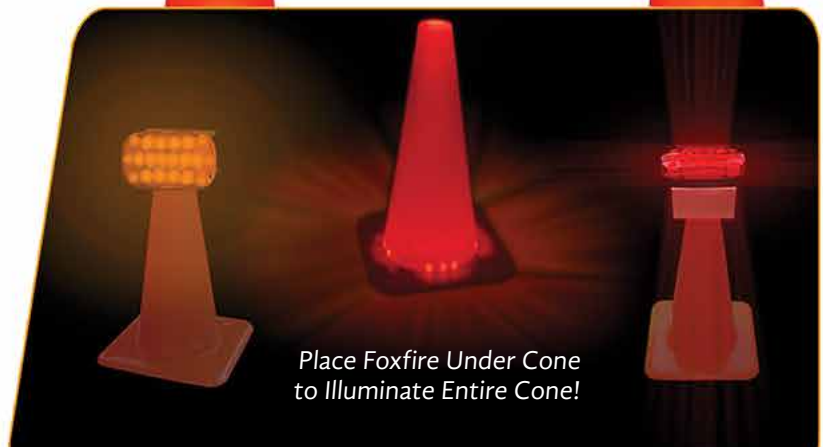
Place Foxfire Under Cone to Illuminate Entire Cone!