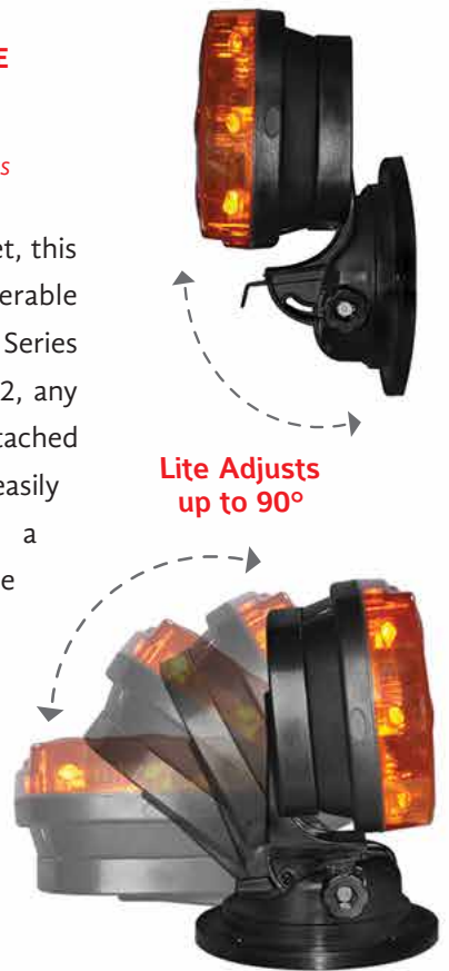
Lite Adjusts up to 90°

Equipped with a strong magnet, this adjustable base adds considerable utility to the FoxFire® and SL Series Lites. With the AMB or AMB-2, any of our lites can be instantly attached to most any metal surface and easily adjusted to any angle within a 90° range. It requires no tools; the lite is attached to the base using a quick release interlock feature and can be removed from the base without disturbing its position.